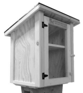
Little Free Library 21" w x 23.5" h x 18.5" d

If you have been thinking about installing your own little library, please remember to follow all road setback rules: it cannot be placed within the road right-of-way (typically the R-O-W is at least 33-feet from the center of the road, but roads may vary); in other words, your library cannot be next to your own mailbox! If you have any questions about the setback rules, please give the township a call.